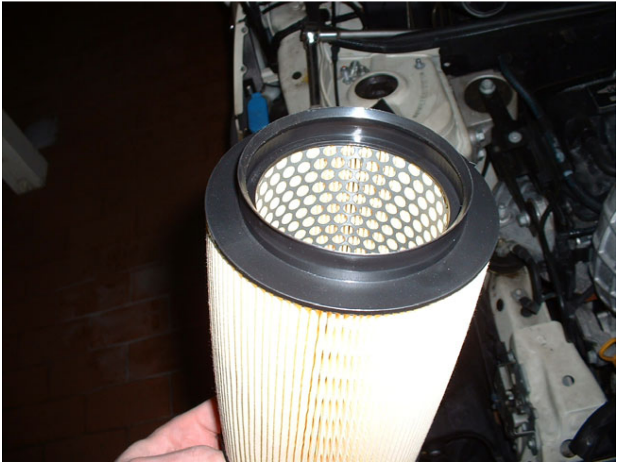
↑ Filter element close up, open end