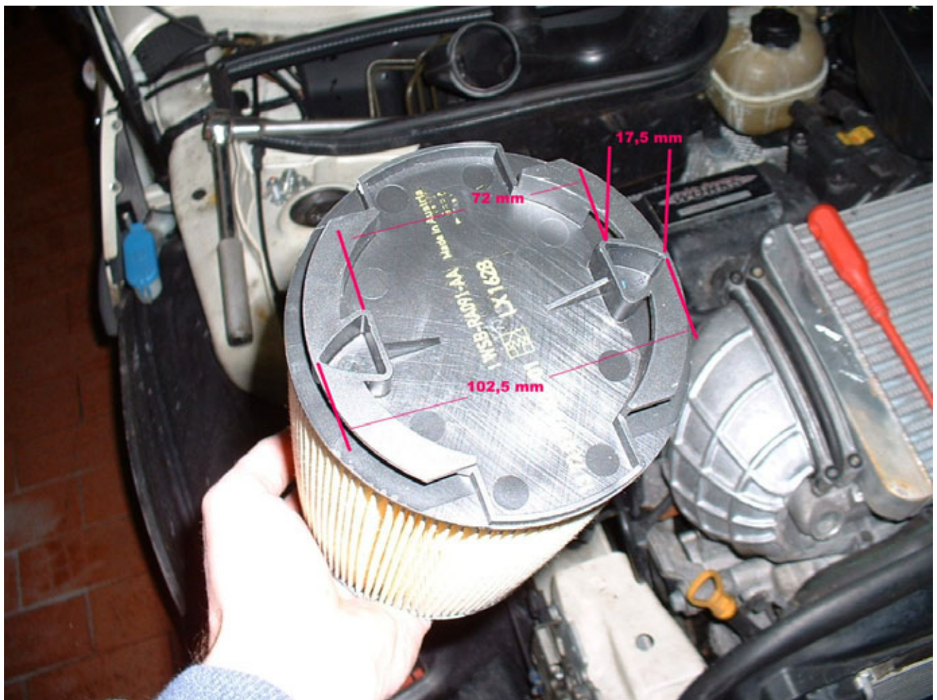
↑ Filter element close up, closed end