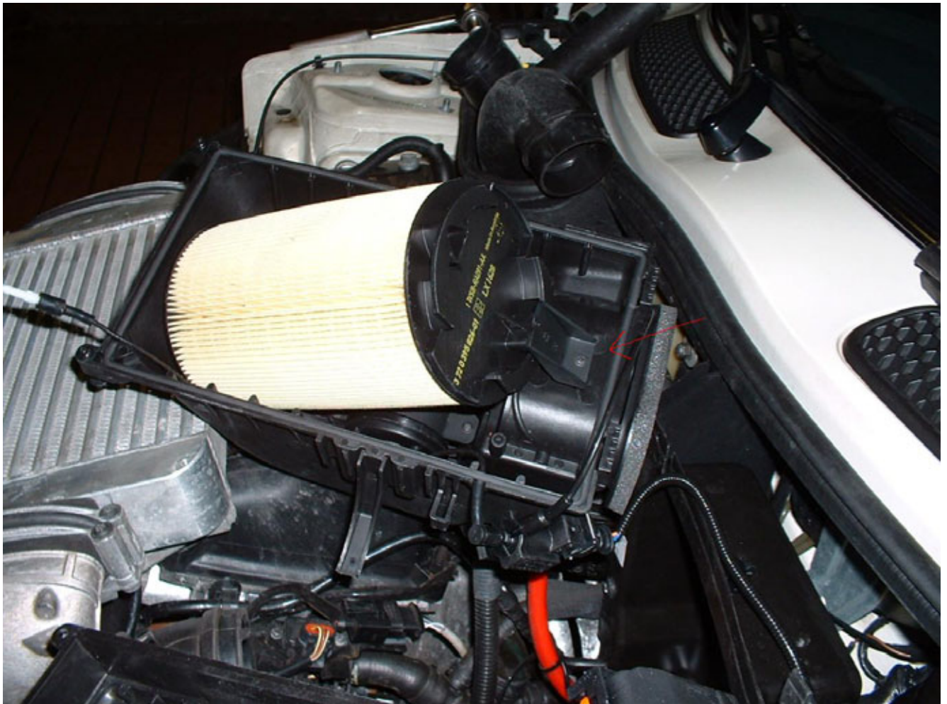
↑ Filter element fitted in upper part of filter box (other view angle) notice application to hold element in place (red arrow)