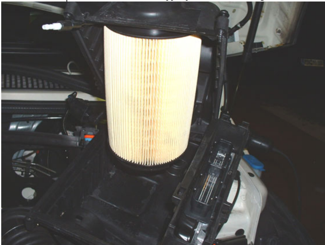
↑ Filter box opened, (filter element fitted to upper part of box)